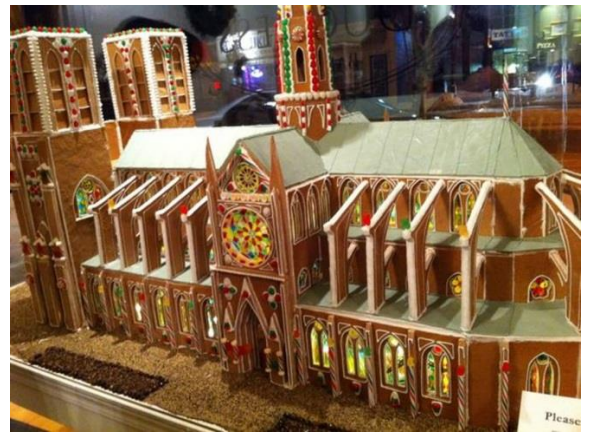
Duchess Bake Shop

Mad Hatters have already started on plans to create a large-scale replica of Eastgate Clock in Vegan Gingerbread with moving hands!