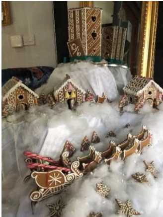
Mad Hatters Window Display 2018

You can create your store in gingerbread, your staff team as gingerbread people, a special product in gingerbread, or perhaps a Chester landmark in Gingerbread. We want to create a festival of Gingerbread to grow year on year to bring visitors from far and wide to admire these majestic creations. This programme is open to all Chester Businesses, organisations, schools, charities and community groups.