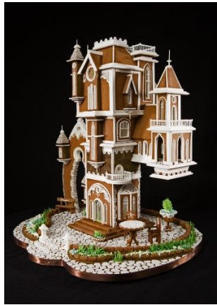
US Gingerbread Competition Winner